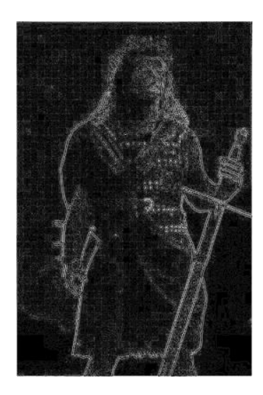
Figure 1: Result of simple edge detection